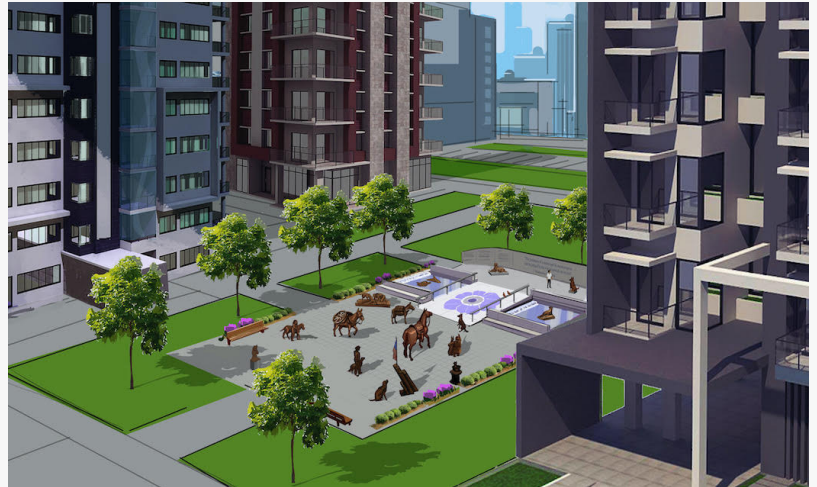
National Service Animals Memorial-Artist's Conceptual Design-Plaza setting